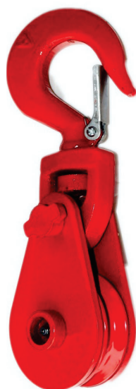
PATESCA GANCHO SNATCH BLOCK WITH HOOK